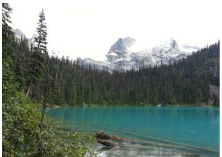
Joffre Lakes & Matier Glacier: some of the other attractions in Whistler