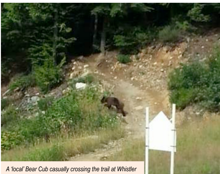
A 'local' Bear Cub casually crossing the trail at Whistler

Whistler has more to offer than just riding (not to say you can't ride every day!). We enjoyed hiking, swimming, eating, drinking and shopping while off the bike. When you can ride 10 hours of lift accessed trails a day, some time off the bike helps keep the blisters and various other aches and pains at bay. I highly recommend the Joffre Lakes hike about an hour north of Whistler.