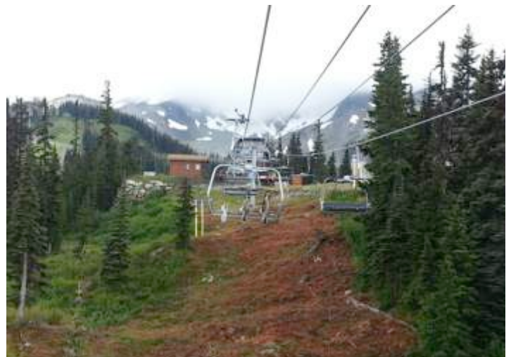
Ready to ride the Garbanzo Zone in Whistler